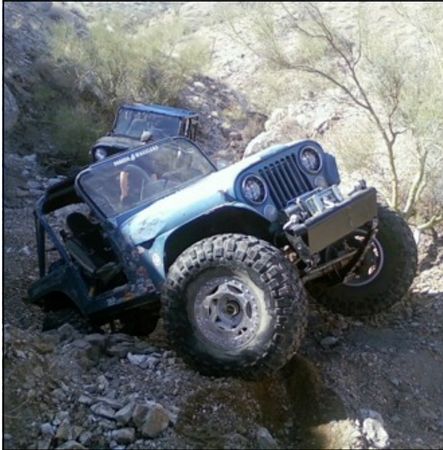
Chris navigating a five foot water fall on Blue Berry Jam in Havasu.